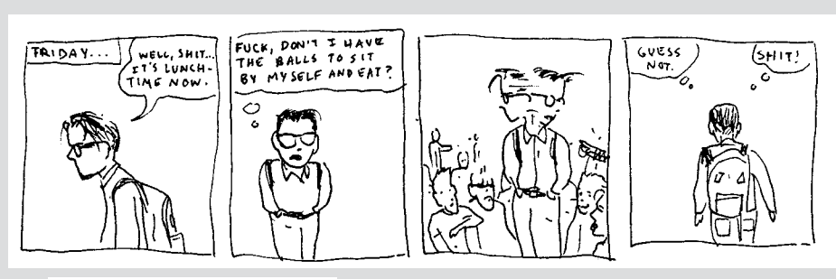
ABOVE: "Lonely Lunch" (excerpt), unpublished, 1991