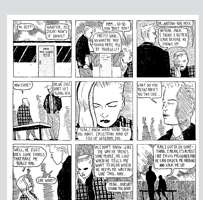
LEFT: "Winning" (excerpt), unpublished, 1989